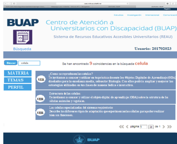
Fig. 4. List of recommendations of the system.

criteria: a) be a student, b) have some hearing or visual disability and c) be in a course of the area of university human formation.