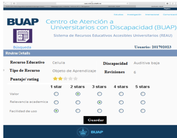
Fig. 5. Review for the value of the educative resource (item).