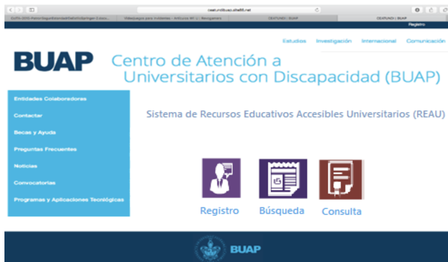
Fig. 3. Prototype of the Recommendation System-REAU.

In order to evaluate, in Figure 5, users cast their vote according to three criteria, in a Likert scale of 1 to 5, where 1 is "Nothing", 2 is "Little", 3 is "Regular", 4 is "Quite" and 5 is "Totally": spacing